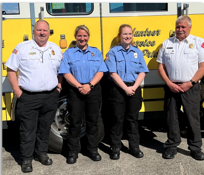
Career Shift FF New Hires