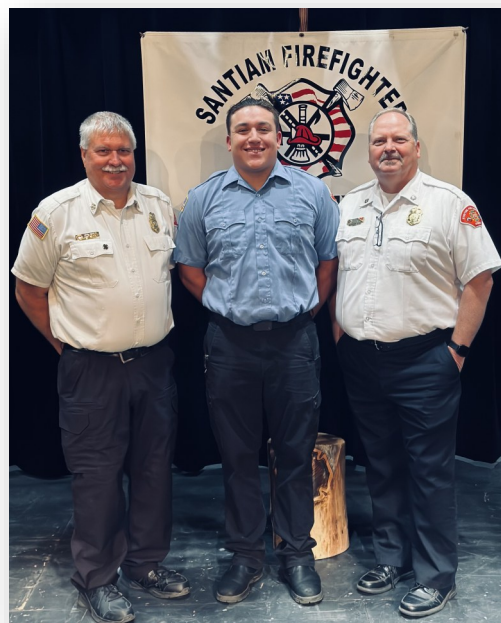
2023 Academy Graduate